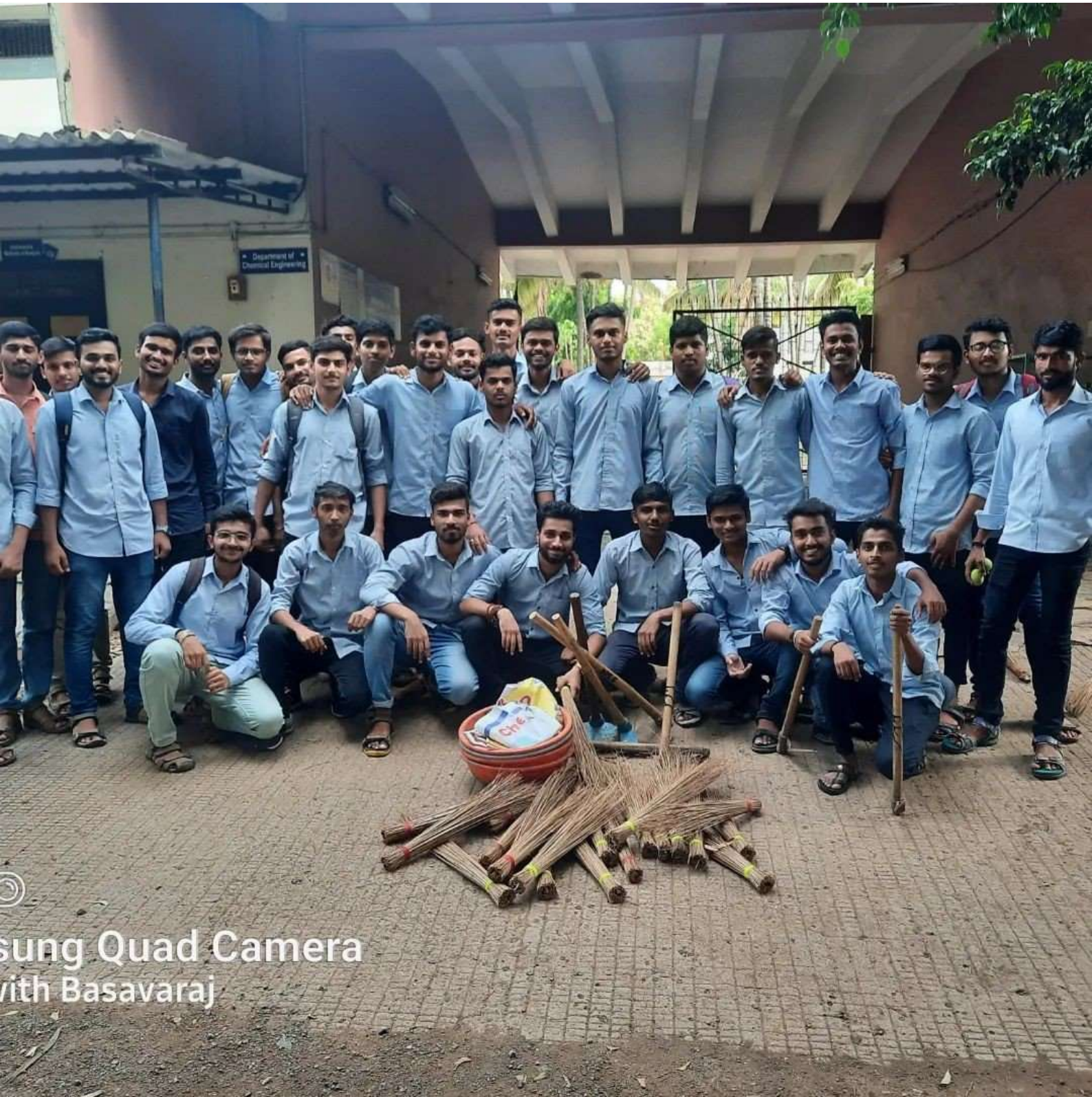
© sung Quad Camera with Basavaraj