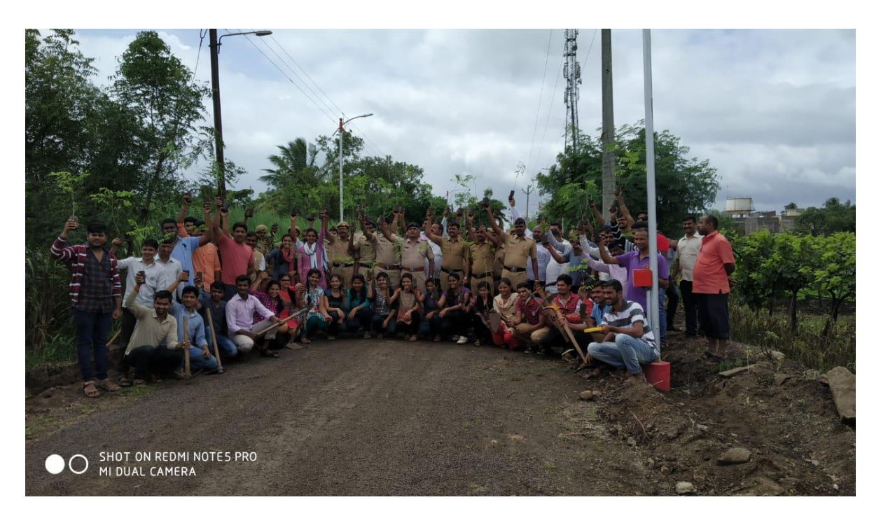
Pic-1 : Tree Plantation at Karnal along with Sangli Police, 22^{nd} Sep,2018