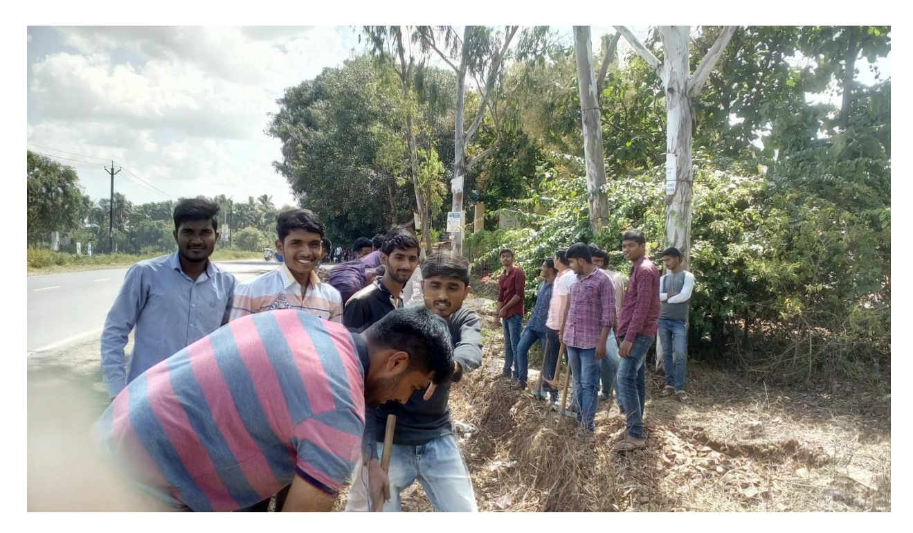
Pic 03: Cleaning at outside main gate area