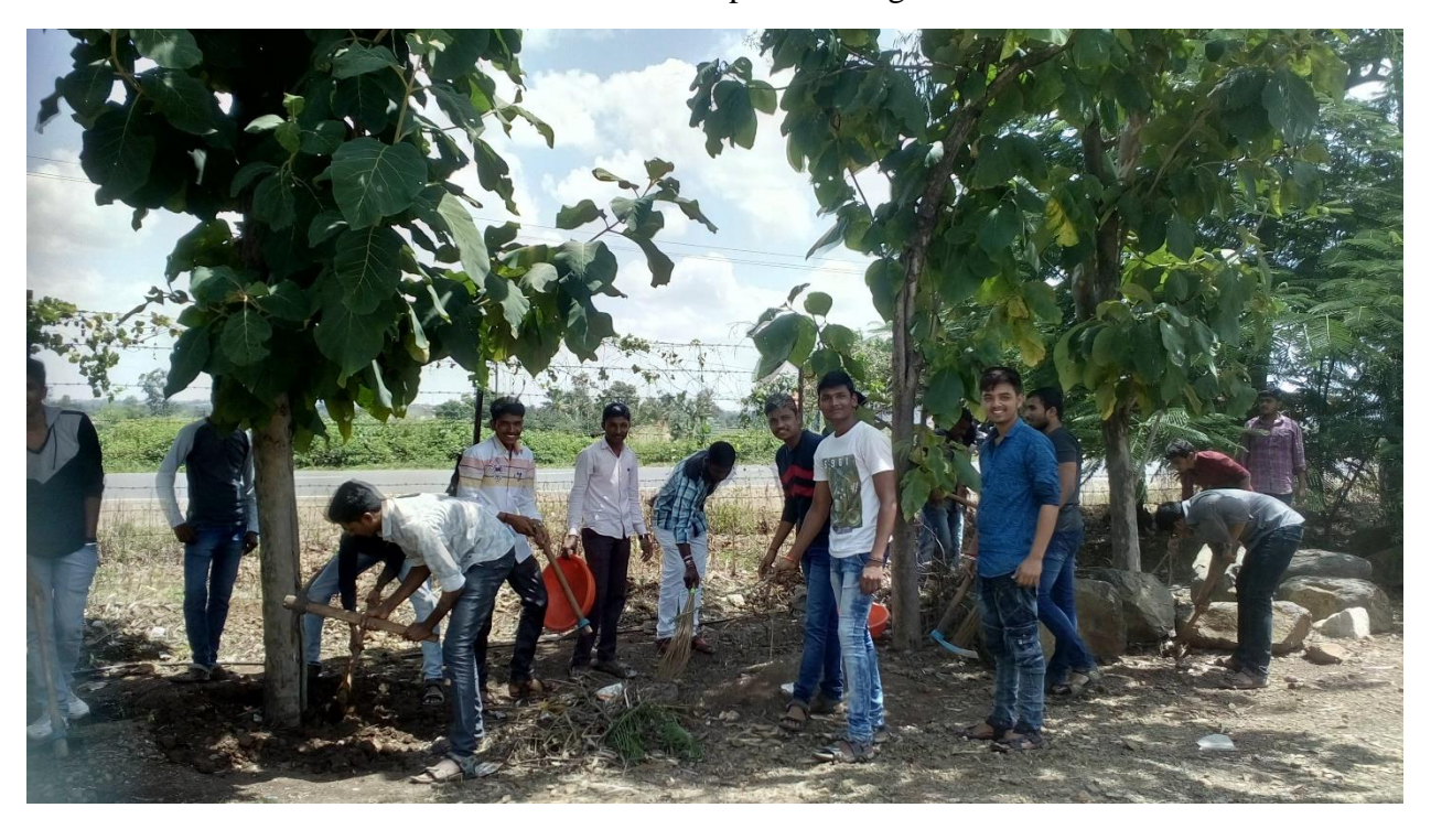
Pic 02 : Campus cleaning at main gate area