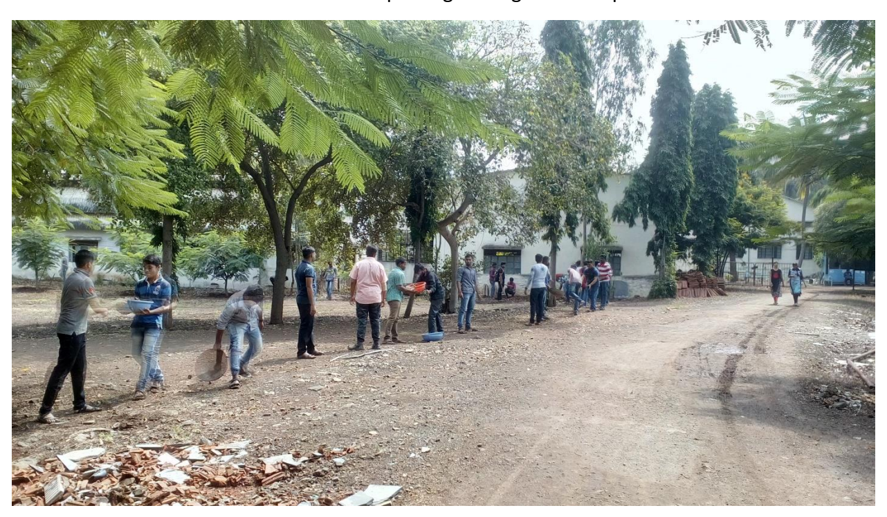
NSS Unit Teamwork