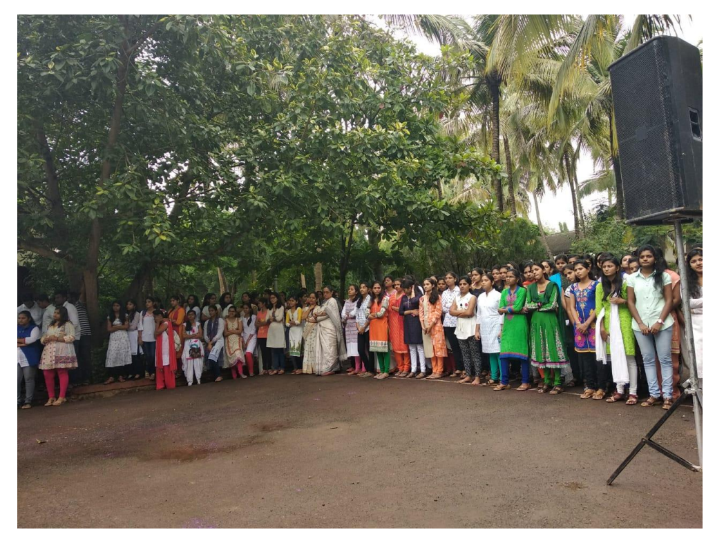
Pic 03: 15<sup>th</sup> August,2018 Independence Day Celebration