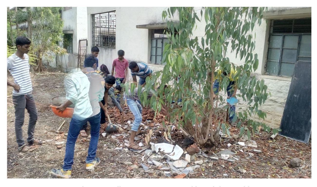
NSS Volunteers collecting wastage near Old Workshop Building