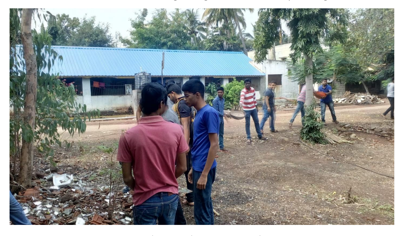
Volunteers showing teamwork