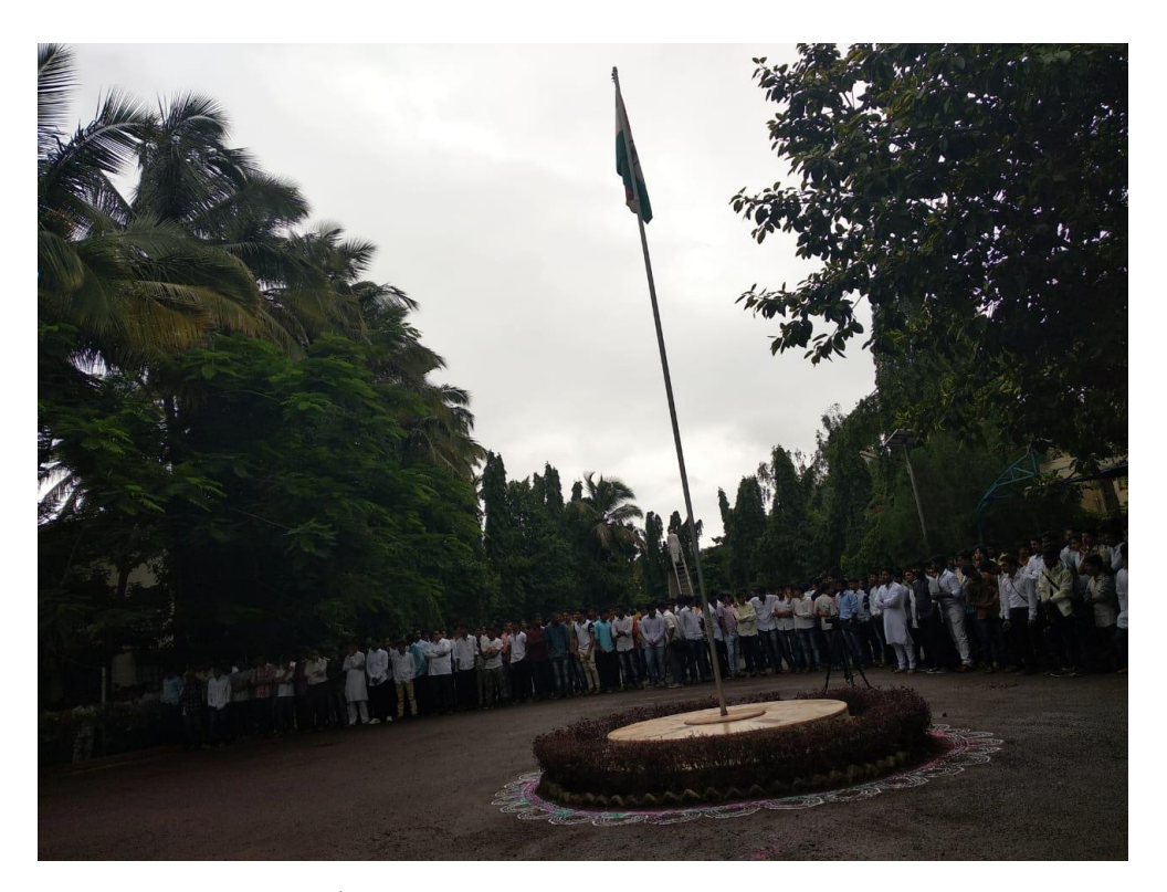
Pic 02 : 15<sup>th</sup> August,2018 Independence Day Celebration