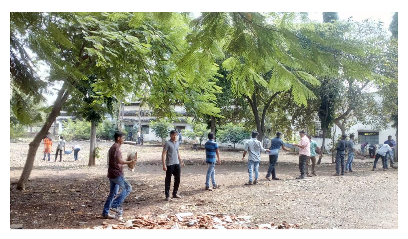
NSS Volunteers passing wastage to a fix spot