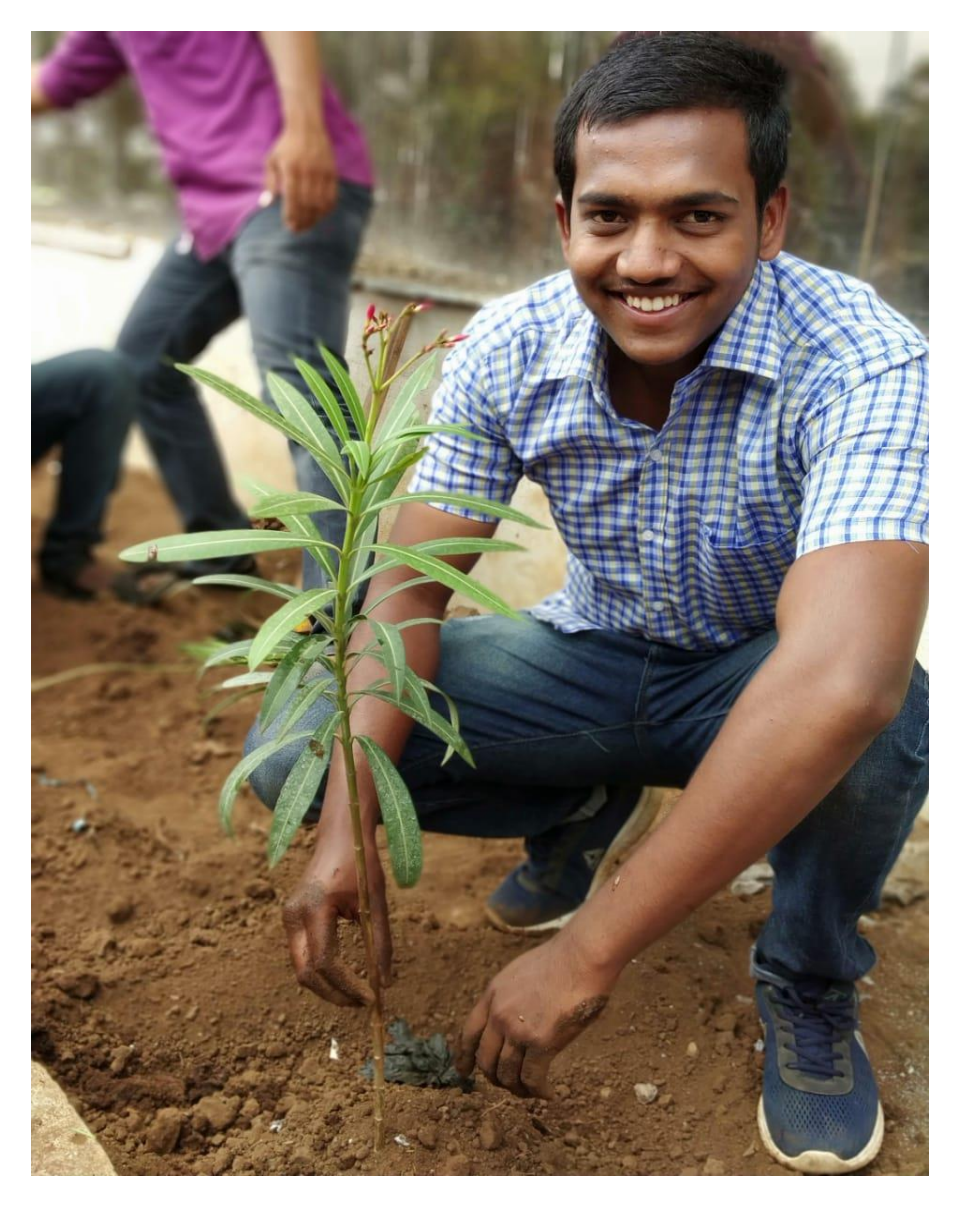
Pic 1; Volunteers planting sapling near Library