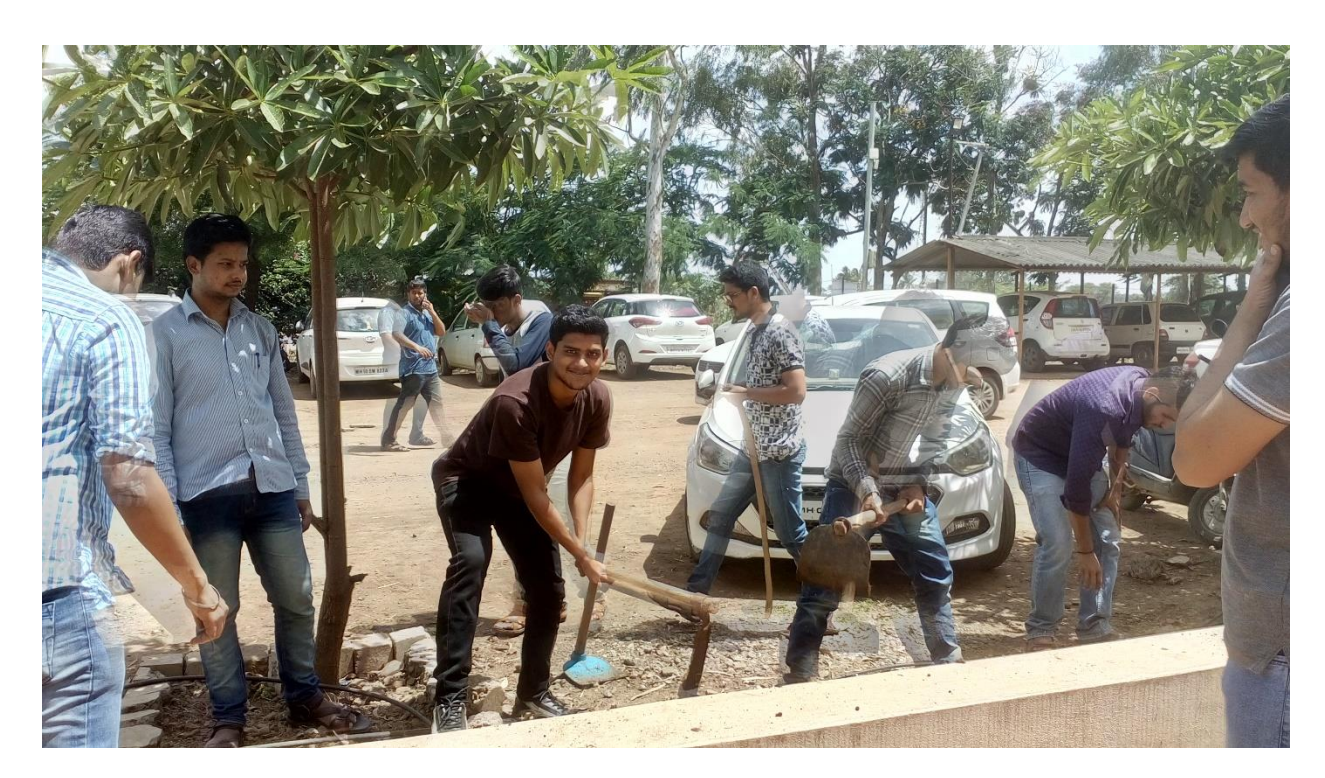
Pic 01: Campus cleaning