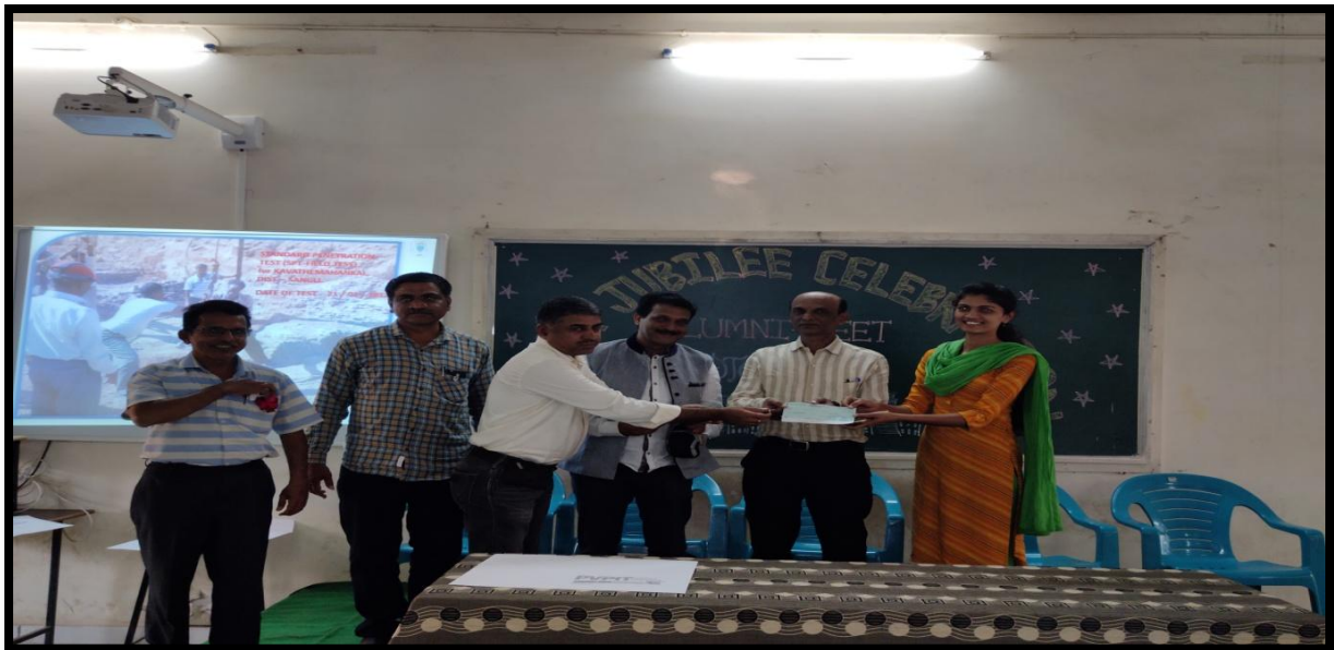
Sponsorship for B.E project in Civil Engineering Department

6) Alumni had taken review of the ongoing projects in department and issued cheque of Rs.10,000/- as a sponsorship for B.E project “Design of cost effective mechanism to treat waste water for sheri nalla” from spandan pratishtan, sangli.