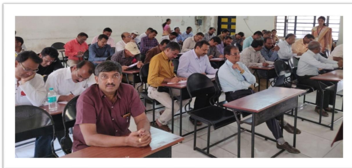
Alumni giving feedback for curriculum enrichment

Alumni coordinator distributed the Alumni feedback forms which included feedback on curriculum and on the infrastructural facilities provided by the institute and collected their opinions through filled Alumni feedback form. Alumni attended the meet, shared their experiences and thoughts with the faculties and guided regarding opportunities and scope in Civil Engineering industries. Vision & Mission of the department and importance of the PEO's & PO's were explained to the Alumni. All the Faculty members were involved in a discussion of the various academic Programs and activities with the Alumni.