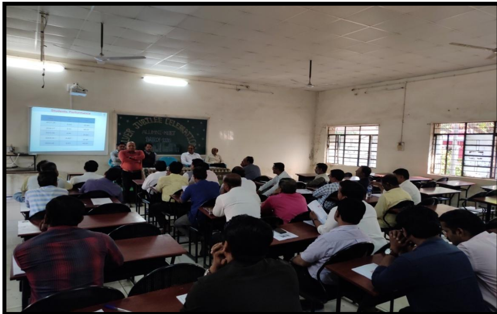
Alumni interaction with faculty and staff members of Department of Civil Engineering