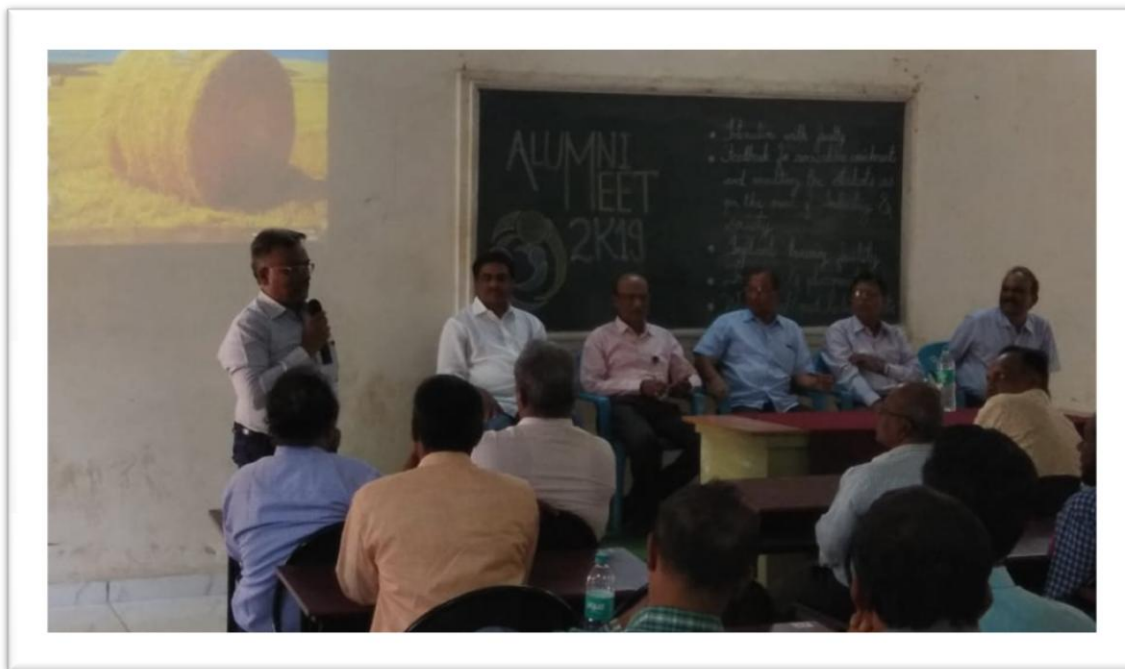
Alumni interacting with faculty and staff members of Civil Engineering Department

Alumni coordinator distributed the Alumni feedback forms which included feedback on curriculum and on the infrastructural facilities provided by the institute and collected their opinions through filled Alumni feedback form. Alumni attended the meet, shared their experiences and thoughts with the faculties and guided regarding opportunities and scope in Civil Engineering industries. Vision & Mission of the department and importance of the PEO's & PO's were explained to the Alumni. All the Faculty members were involved in a discussion of the various academic Programs and activities with the Alumni.