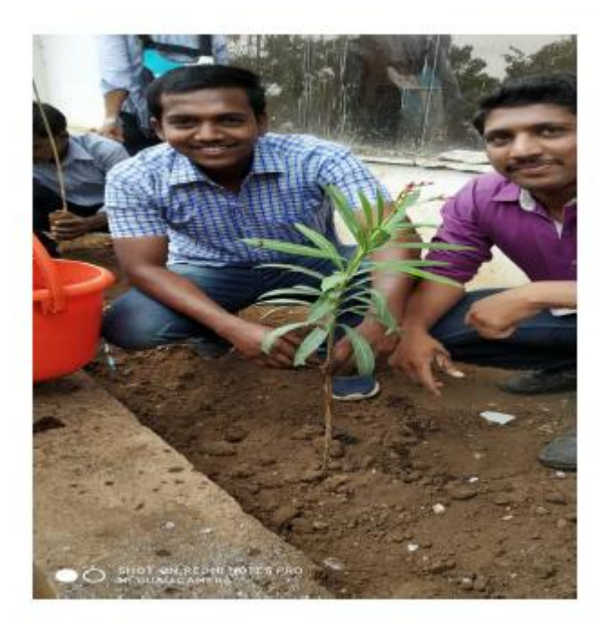
Picture 15. 12 Tree Plantation in College Campus by NSS.Date:-25 August 2018