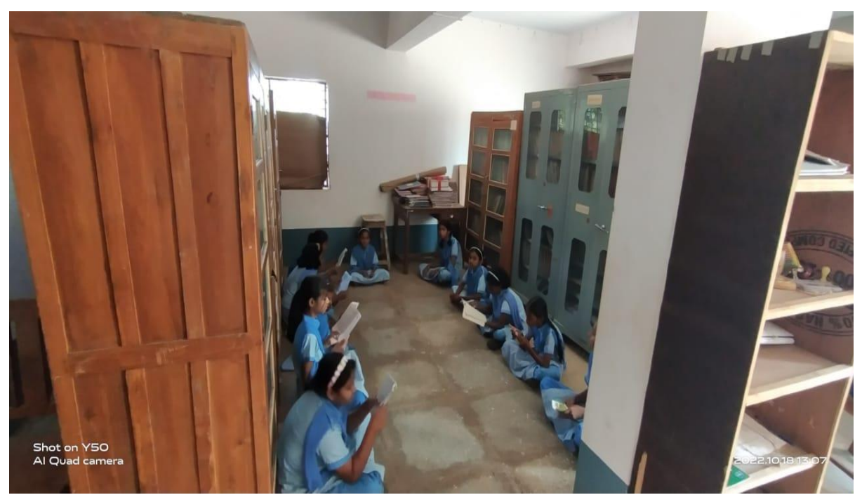
Picture 1. Celebration of Vachan Prerana Din (Reading Motivation Day)Date:-18/10/2022(APJ Kalam Foundation)