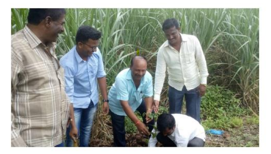
Picture 14.Tree Head of Karnal Village Planting Tree( NSS.)Date 22 September 2018