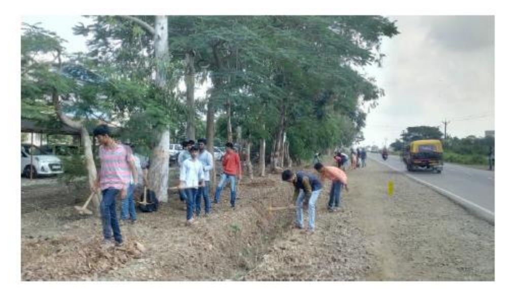
Picture 18.Institute Surrounding Cleaning Drive on the Occasion of Mahatma Gandhi Jayanti.Date 2 Oct.2018