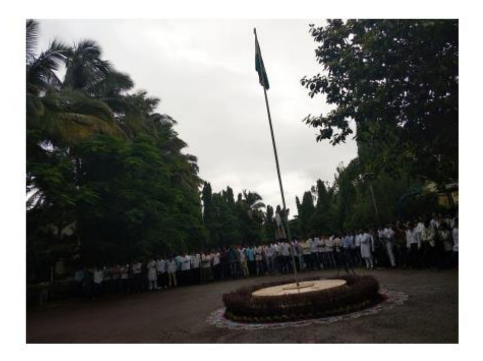
Picture 13. Independence Day Celebration in Institute Coordinated by NSS.Date:-15 August 2018