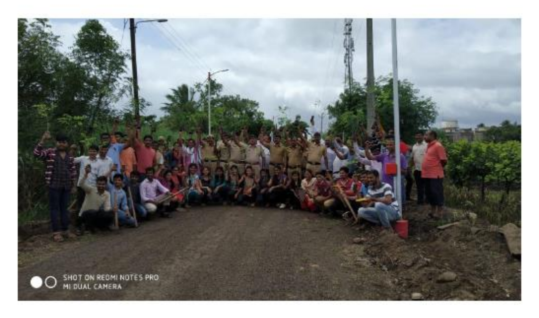
Picture 14.Tree Plantation in Karnal Village with Sangli Police and Institute NSS.Date 22 September 2018